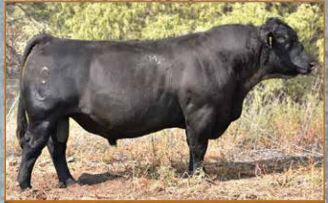
CCR Stockman 8033E