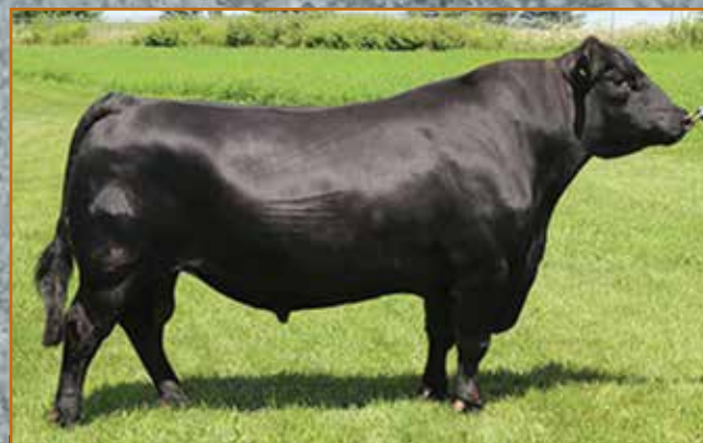
K C F Bennett Assertive

• Calving Ease son of Absolute that sires length and a touch more frame. Sires long necked, long spined offspring; multi trait standout. Daughters should be milky and feminine with neat udders. Outcross pedigree to most herds.