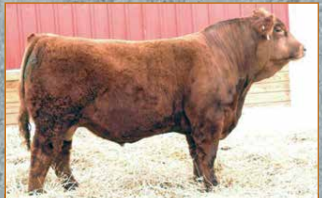
Traxs Rushmore X103