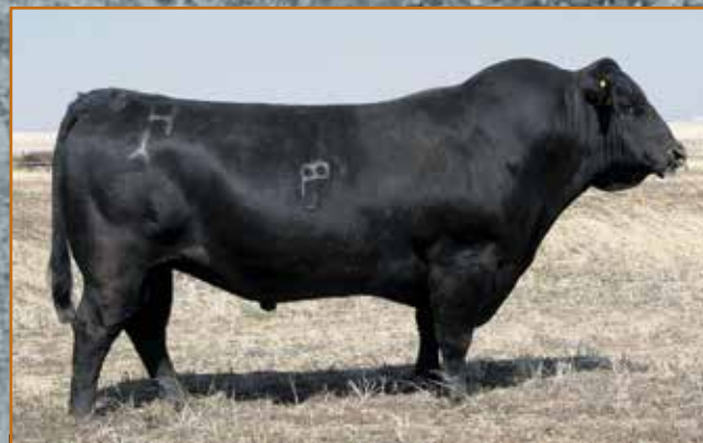
H A Image Maker 0415

• Image Maker has been used very successfully in large heifer projects all across the country. He sires extra length of body, with heavy weaning weights and extra feedlot growth along with outstanding daughters that have exceptional fertility with good udders and are very easy to be around. 0415 is homozygous for tenderness markers and homozygous SNP530, an additional indicator of tenderness. 0415 is among the top 1% of the bulls in the breed for WW and top 1% for $W Index.