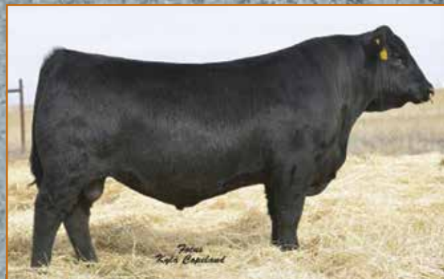
Haynes Outright 452

• Sound, soft made Absolute son with added length and rib. Big time performance in a moderate sized package. Dam is controlled in size, with impeccable udder quality and looks. He'll add pounds to steers and make eye appealing, broody daughters.