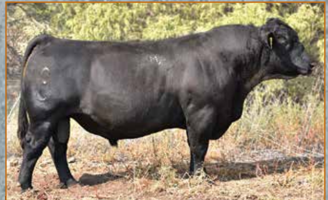
CCR Stockman 8033E

2018 High Selling Bull from Cow Camp Ranch, purchased by Stockman's Source, our friends, Chrismans and Martins. Powerful growth and muscle sire that remains clean made, tight sheathed and travels freely on ideal feet and legs. Proven maternal heritage that stacks some of the breeds best including the "Apple" cow and Cowboy Cut's mother. Predicted to transmit optimum milk levels and great udders for increased longevity in western range environments. Phenotypically impressive from any angle, masculine and big nugged, absolute stud with a superb disposition.