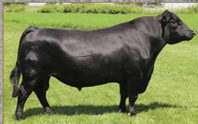
K C F Bennett Assertive

Calving Ease son of Absolute that sires length and a touch more frame. Sires long necked, long spined offspring; multi trait standout. Daughters should be milky and feminine with neat udders. Outcross pedigree to most herds.