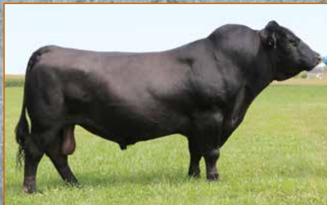
Quaker Hill Rampage 0A36