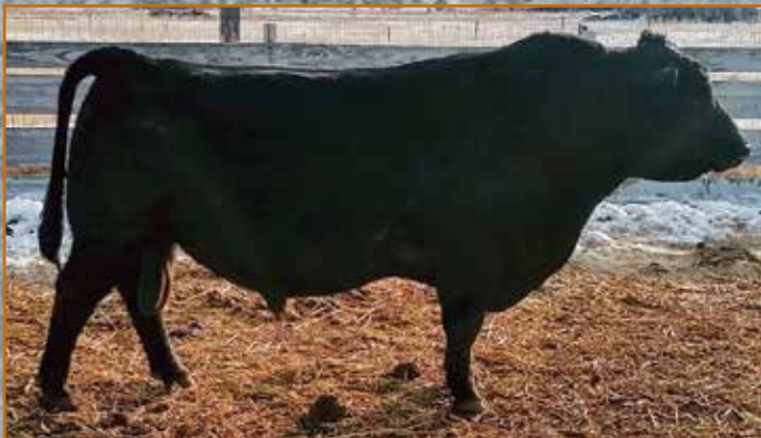
JGM Ammunition 3C3 - Sire of Lot 26