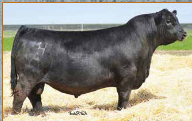
HA Cowboy Up 5405