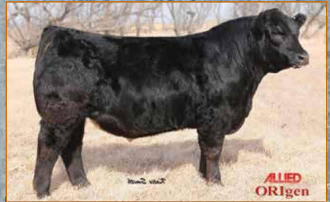
W/C United 956Y

High growth, high performance (Top 1% WW & YW) while keeping frame in check. We look for him to replace Upgrade as our go-to SimAngus sire. Massive volume, exceptional structure, and head turning phenotype. We don't have daughters in production as of now, but they look the part.