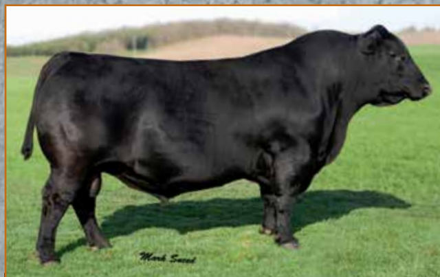
S A V Thunderbird 9061