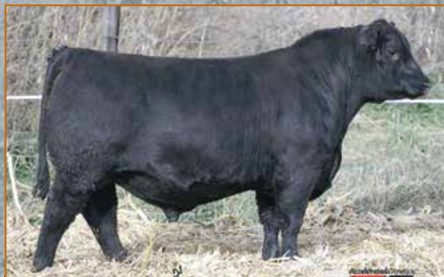
Baldrige Compass C041