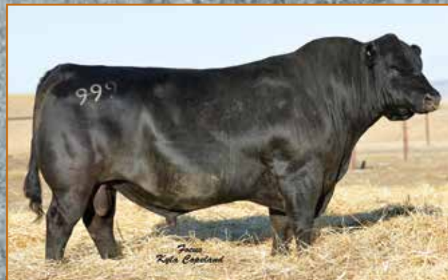
LD Emblazon 999

Highest performing Emblazon son in the breed. Emblazon kind with an upgrade in performance and frame. Sons are big middle, stouter boned, and wide made. Daughters will be broody, tight uddered, with soft attitudes.