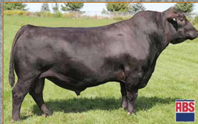
Spring Cove Crossbow

Calving ease Angus sire that worked well back on our SimAngus heifers. Correctly made, with extra width and muscle expression. Daughters should be very functional with excellent udders. We'll have one Angus and several SimAngus bulls by this sire.